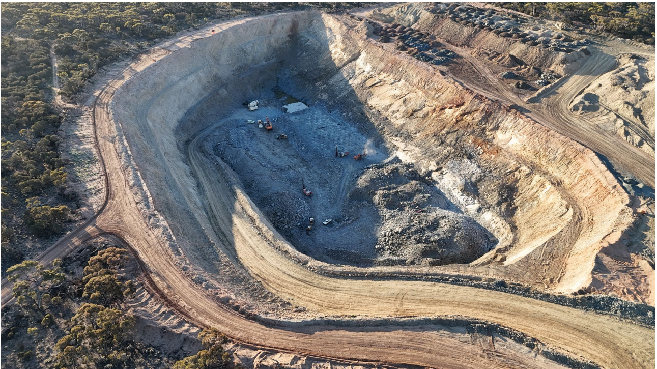
Jeffrey's Find Gold Mine: 13 August 2024.

Auric will update the market on a regular basis whilst processing and gold sales are occurring.